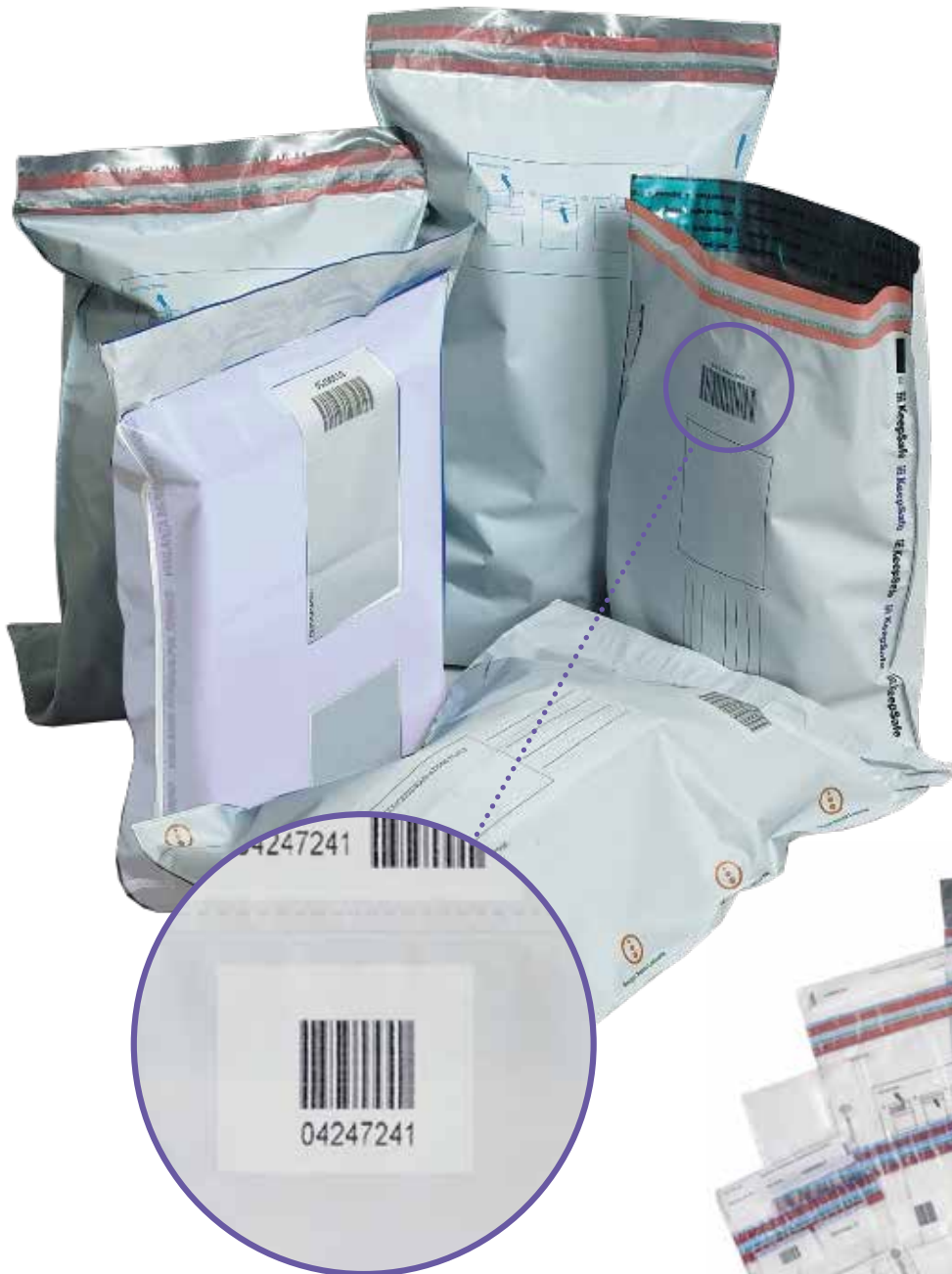
UNIQUE ID NUMBER