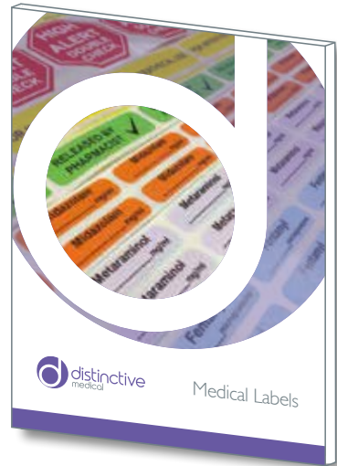
Medical Labels Brochure