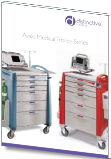
Avalo Medical Trolley Series Brochure