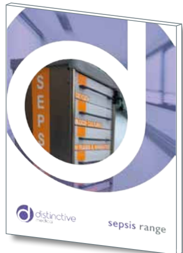
Sepsis Storage Solutions Brochure