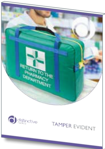
Tamper Evident Range Brochure