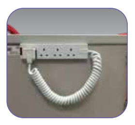
Electrical extension socket