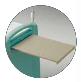
Pullout Writing Surface