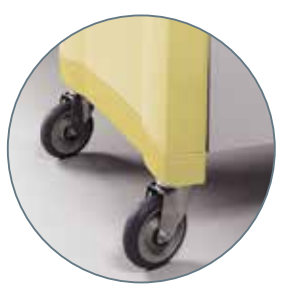
Spread Caster Position provides stability control by moving the wheels out toward the corners of the cart frame