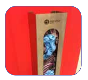
Glove box holders