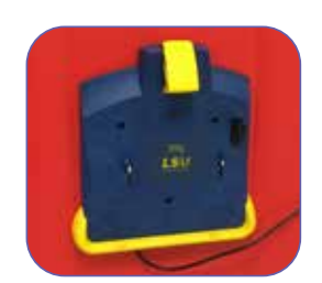
Suction unit brackets