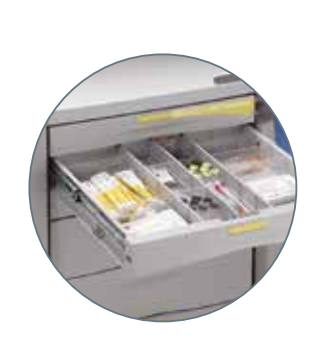
Integral Drawer Dividers offer the flexibility to organise and re-arrange drawer contents

The top of the trolley provides a flat, spacious surface for the preparation of solutions. If extra space is needed an optional slide out panel can be added.