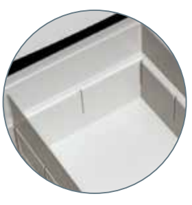
Seamless Drawer Trays are durable and prevent issues associated with pop rivets or sharp edges found in metal drawers