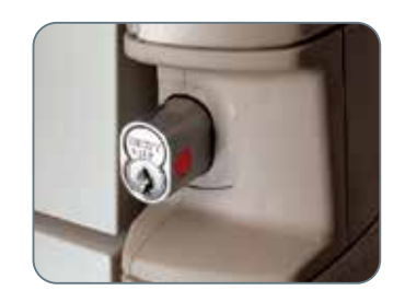
Relocking The most simple but secure locking system by giving only those authorised access to the key. Ideal for trolleys that require advanced security. The removable lock system allows for flexibility by making changes to keys easy.